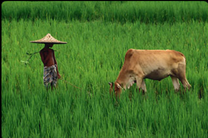
- MSNBC.com March 8, 2007