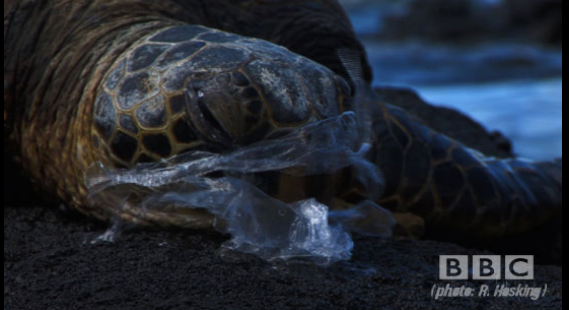
- World Wildlife Fund Report 2005

They die after ingesting plastic bags which they mistake for food