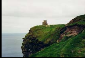
- BBC News August 20, 2002

Ireland took the lead in Europe, taxing plastic bags in 2002 and have now reduced plastic bag consumption by 90%