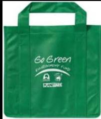
- NPR.org (National Public Radio)

On March 27th 2007, San Francisco becomes first U.S. city to ban plastic bags