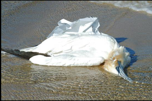
- World Wildlife Fund Report 2005