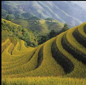
- CNN.com/asia January 9, 2008