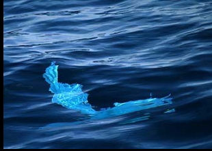
- British Antarctic Survey

Plastic bags have been found floating north of the Arctic Circle near Spitzbergen, and as far south as the Falkland Islands