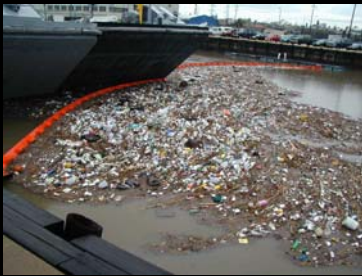
- National Marine Debris Monitoring Program

Plastic bags account for over 10 percent of the debris washed up on the U.S. coastline