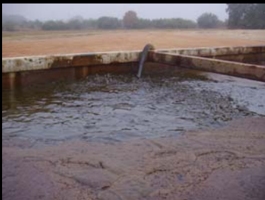
- CNN.com/tecnology November 16, 2007

Plastic shopping bags are made from polyethylene: a thermoplastic made from oil