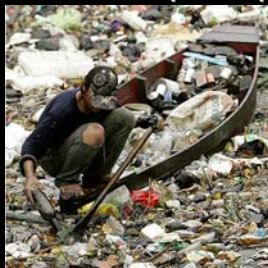
- CNN.com/tecnology November 16, 2007

Plastic bags photodegrade: Over time they break down into smaller, more toxic petro-polymers