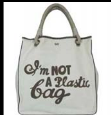
- PlanetSave.com February 16, 2008

Israel, Canada, western India, Botswana, Kenya, Tanzania, South Africa, Taiwan, and Singapore have also banned or are moving toward banning the plastic bag