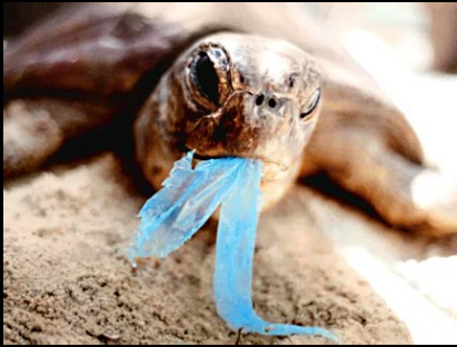
- CNN.com/tecnology November 16, 2007

As a consequence microscopic particles can enter the food chain