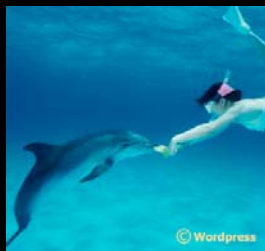
- World Wildlife Fund Report 2005