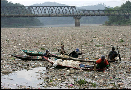
- CNN.com/tecnology November 16, 2007

which eventually contaminate soils and waterways